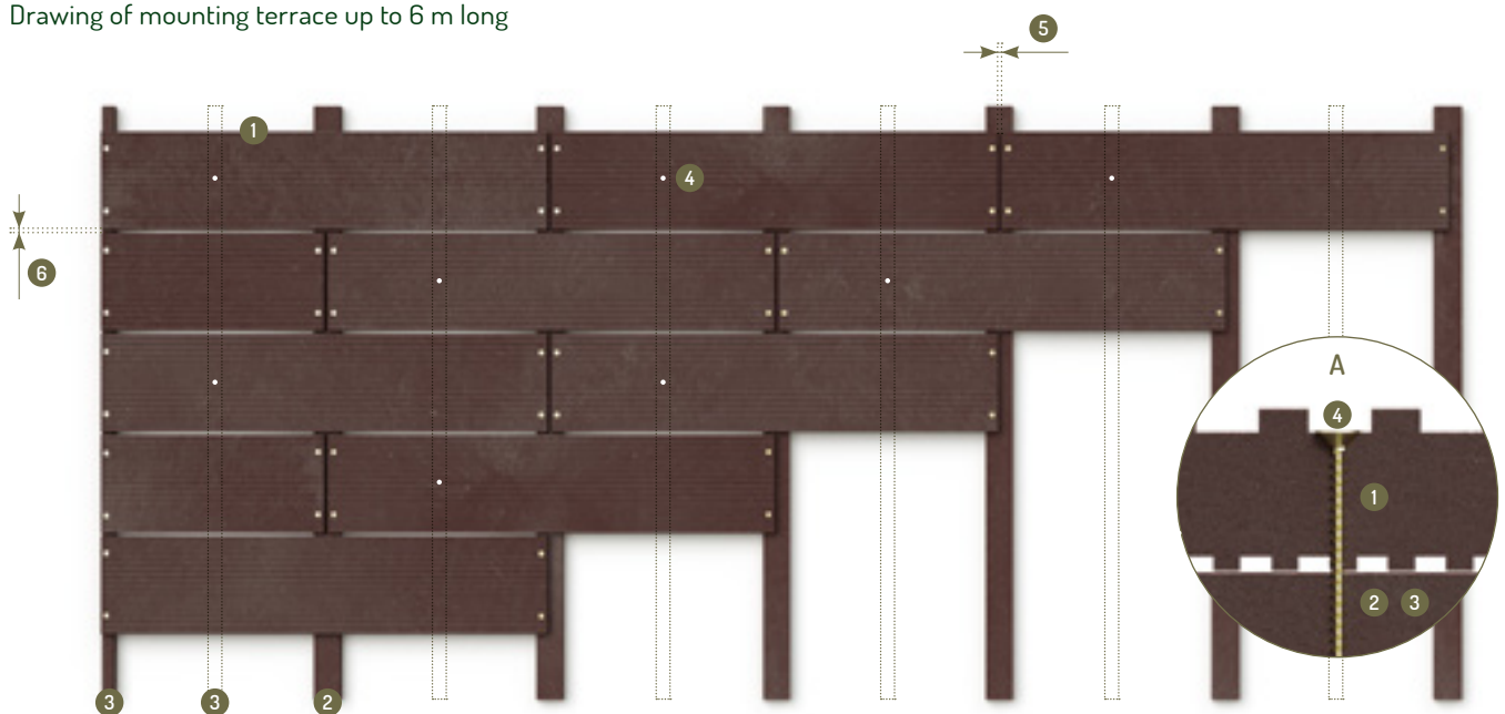
Drawing of mounting terrace up to 6 m long

! When working / assembling, use the protective equipment!